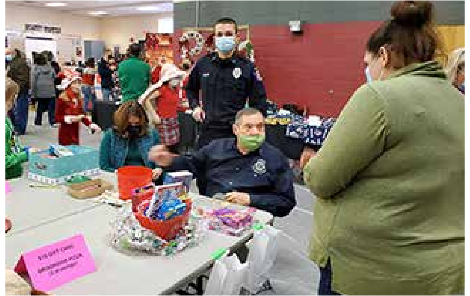
Loudon Elementary School PTA Santa's Breakfast